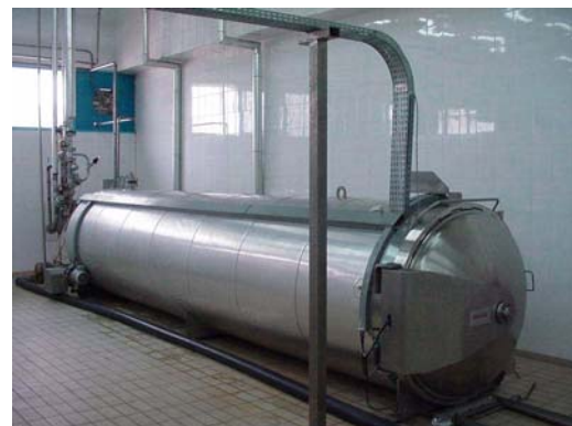
Candia Licensee - Egypt