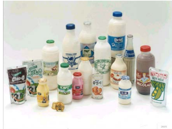
Milk products sterilized in Stériflow

The taste of sterilized product is closer to the taste of HTST processed milk.